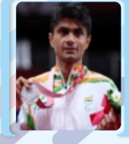
Shri Suhas Lalinakere Yathiraj IAS, District Magistrate, G.B. Nagar (UP) Silver Medalist in Tokyo 2020 Paralympic Games