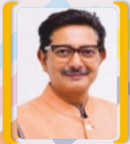
Shri Anurag Sharma Hon'ble Member of Parliament Jhansi & Lalitpur Constituency, UP