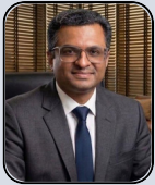
CS VRUSHAL SAUDAGAR