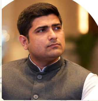
Compliance Officer and Risk Manager The Xander Group – GIFT City