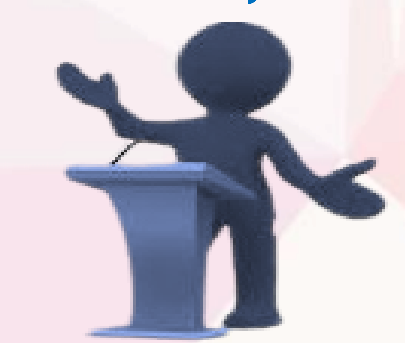
Declamation Competition (Topic: Global Business)