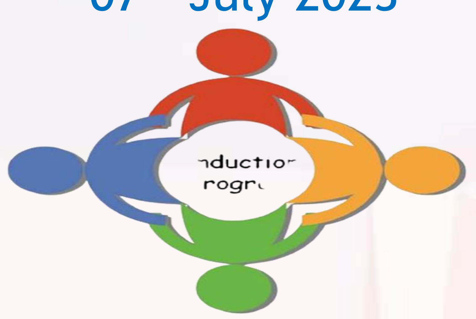
Faculty Induction Program