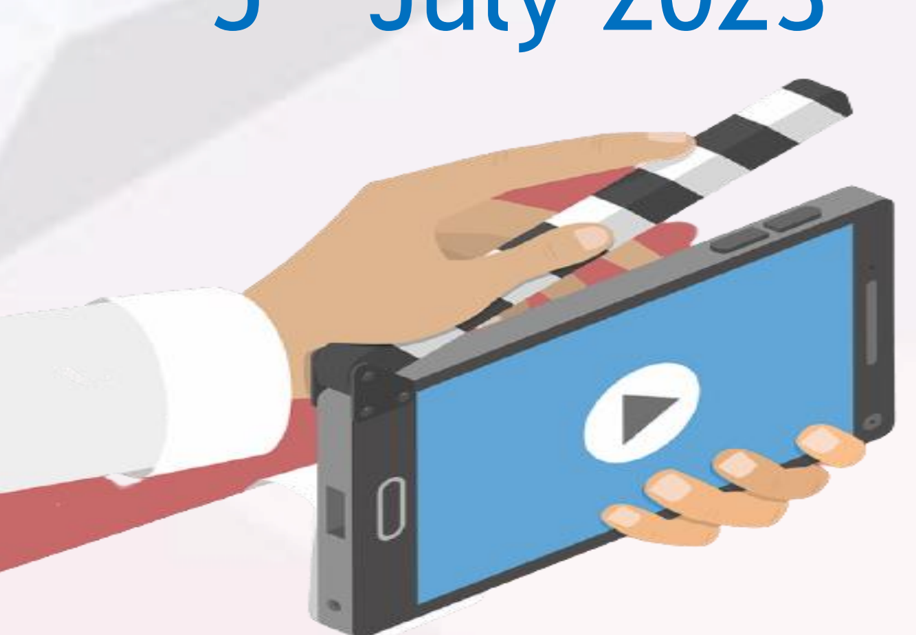
Video Bytes Competition (Topic: Due Diligence)