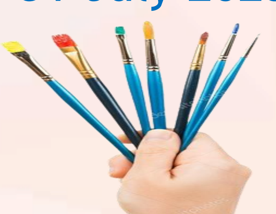
Painting Competition (Topic: Corporate Social Responsibility)

Registration Link: https://forms.gle/AQsE85TV19h8Kb346