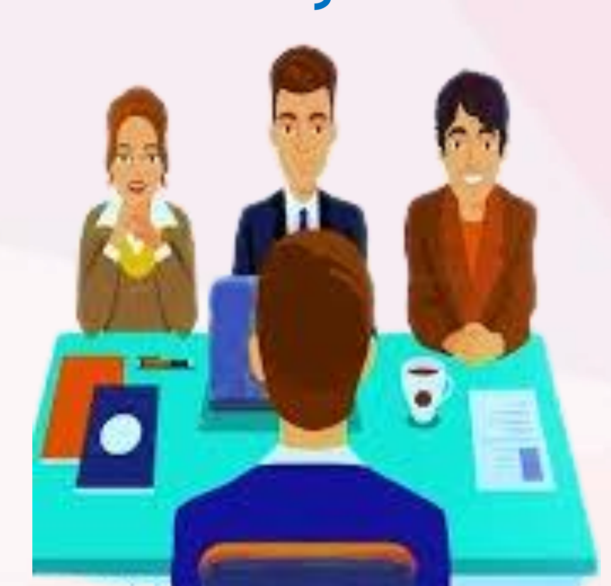
Training placement Drive