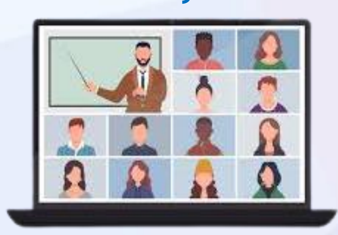
Class Room Teaching