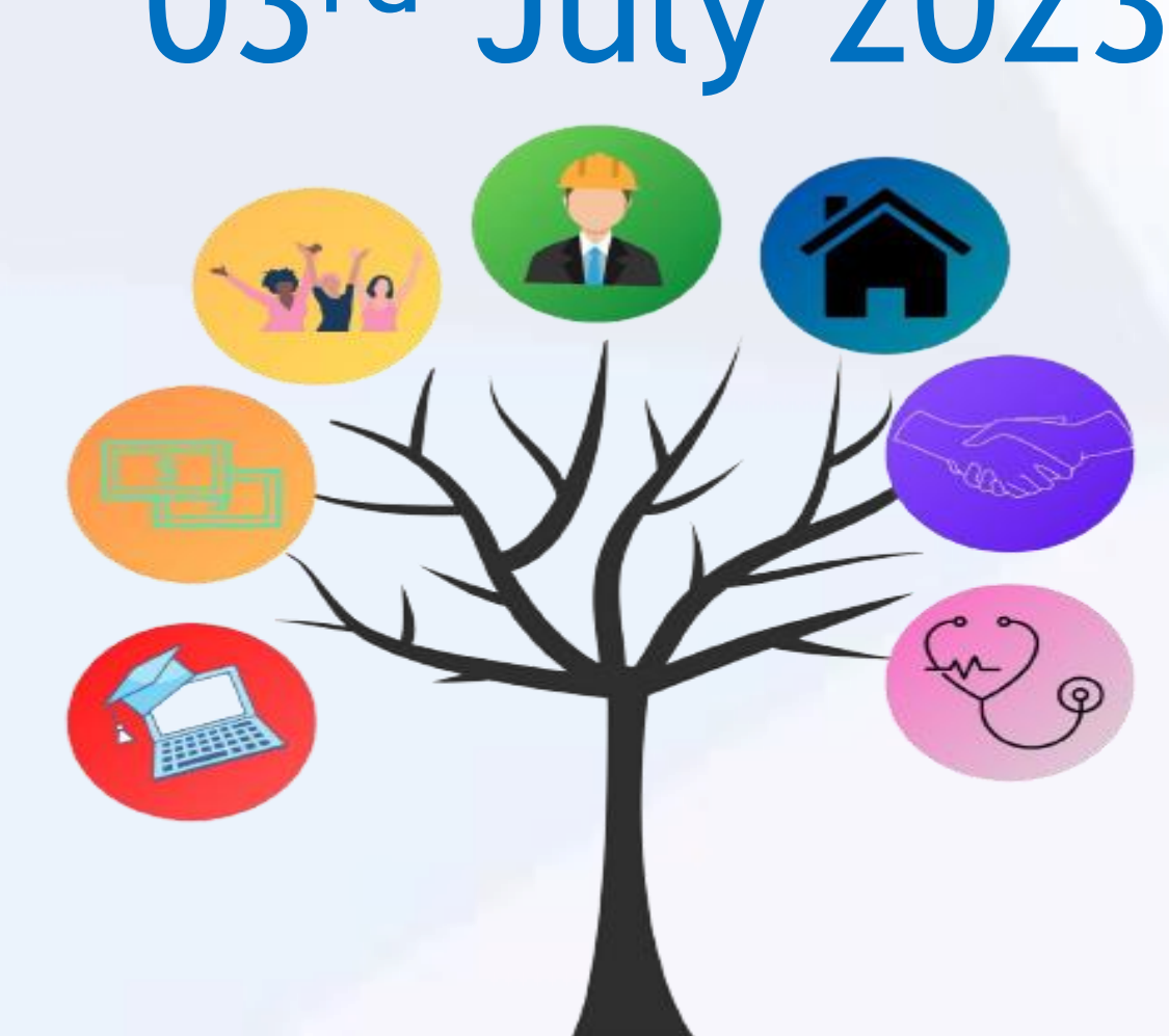
LifeSkills (Topic: Effective communication)