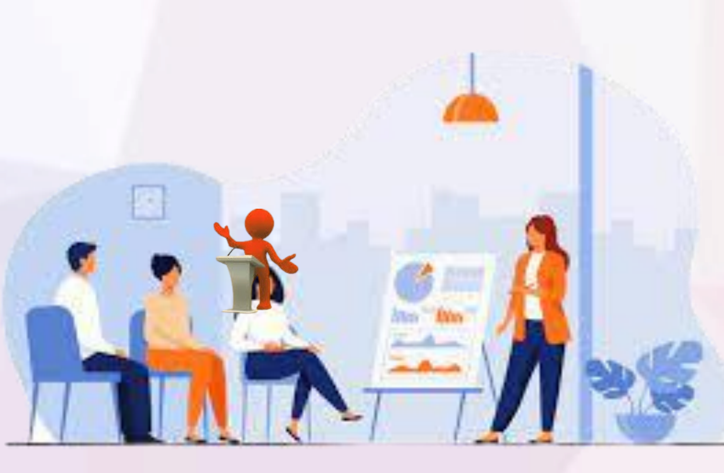
IT Awareness Session (MS Word, Excel & PPT)