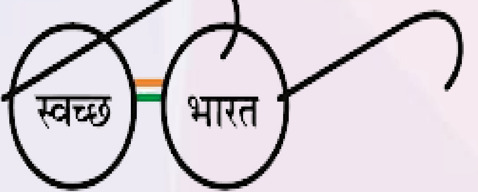
स्वच्छ भारत अभियान