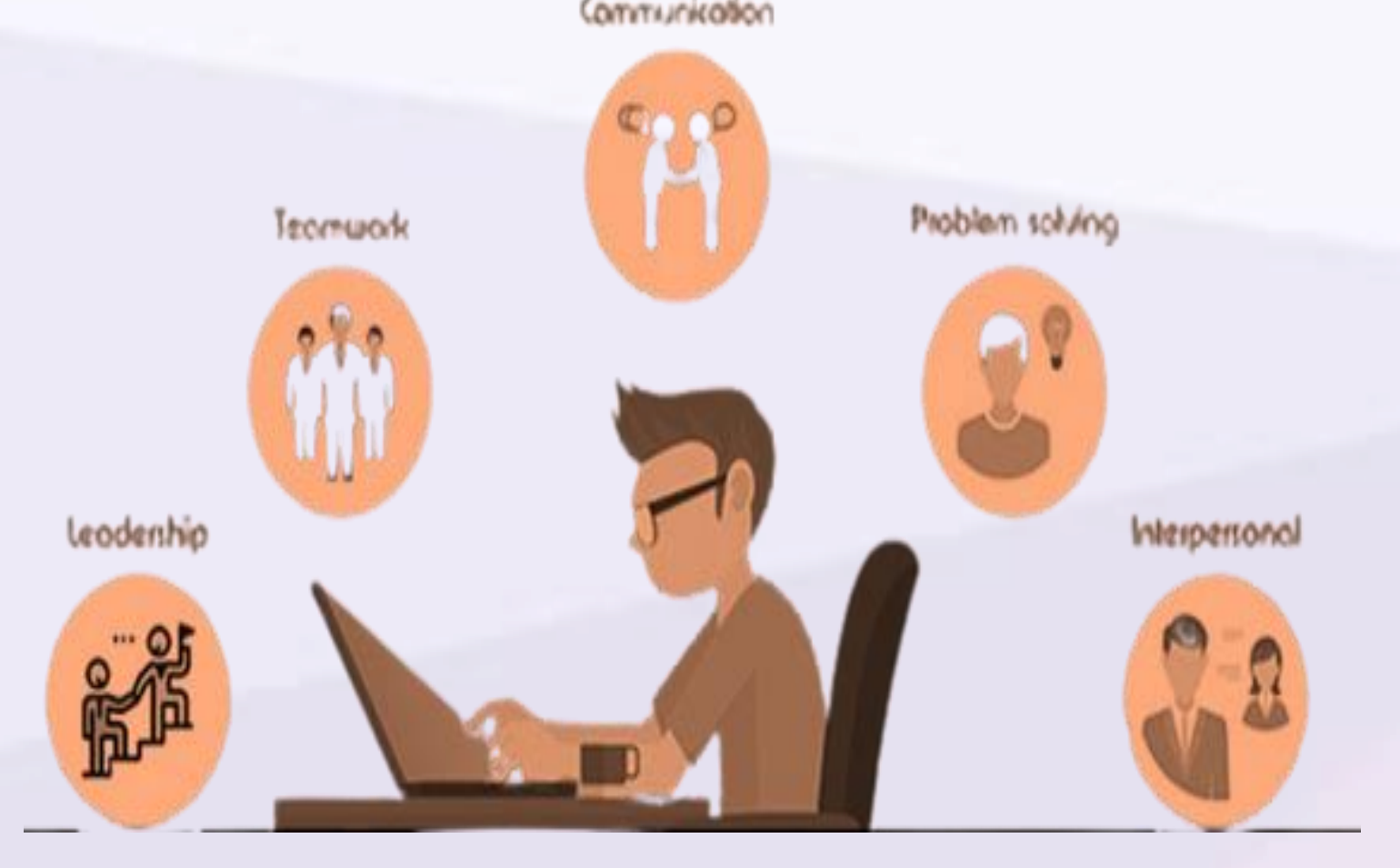
Skills Session (Topic: Communication Skills)