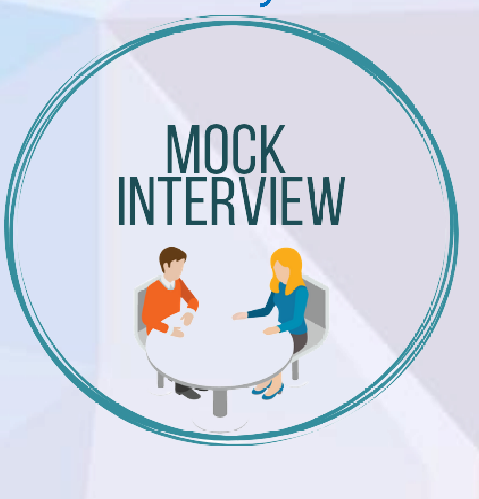
18<sup>th</sup> July 2023