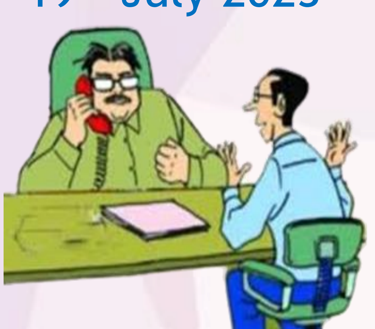
Zero Grievance Day