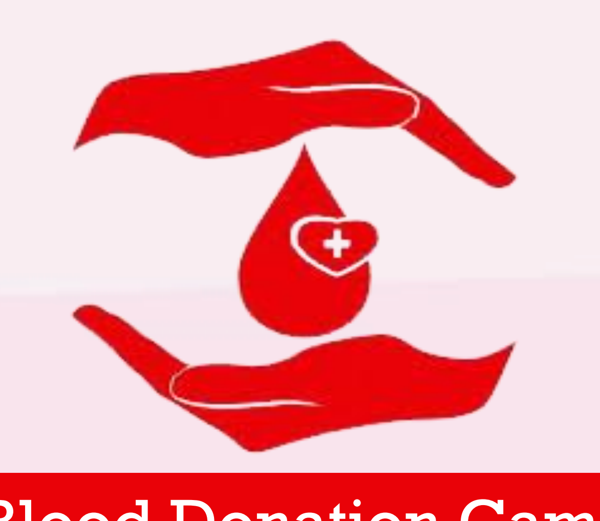
Blood Donation Camps