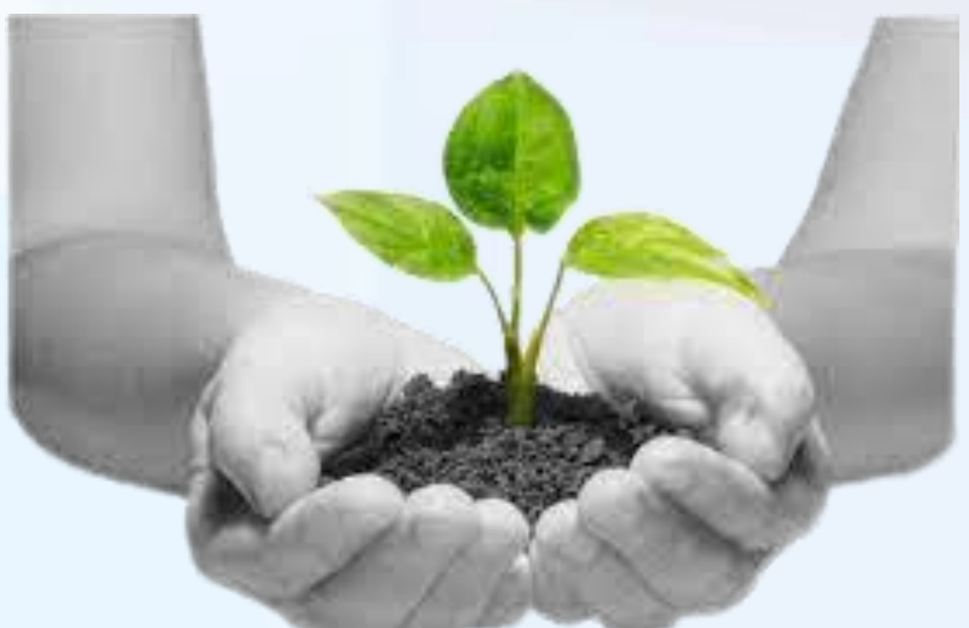
वन महात्सव (Van Mahotsav Day)