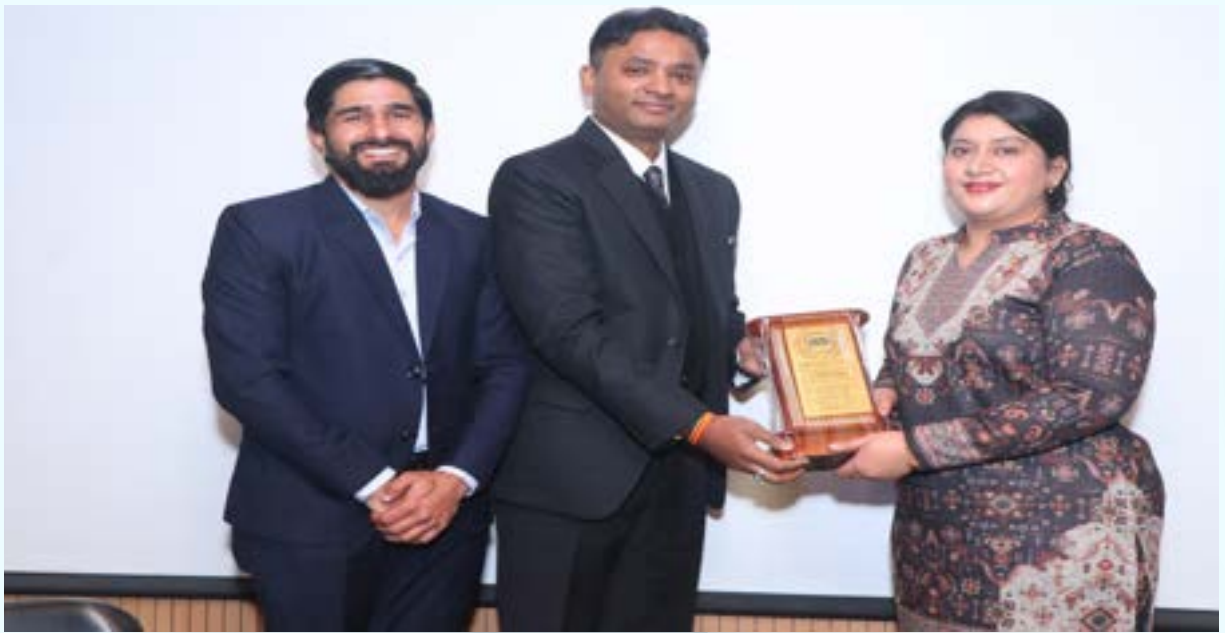
Meeting With Registrar of Companies on 02nd February 2026