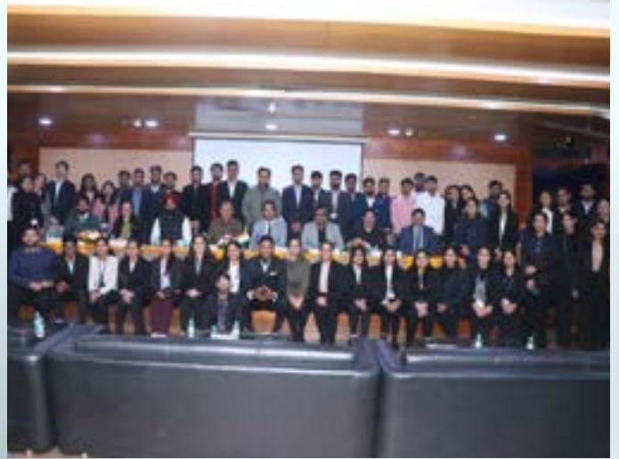
Report on conduct of Republic Day Celebrations on 26 th January 2026 at ICSI Noida