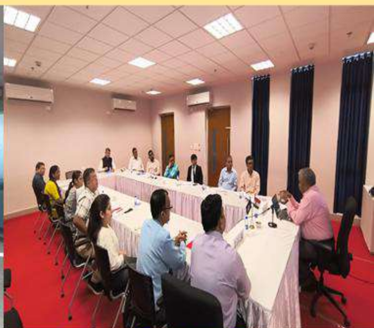
Previous Residential Programme