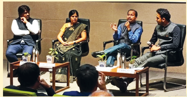
ICSI-Pune Chapter organised ESG conclave on 29 th May 2024 at Bhandarkar Research Institute, Shivajinagar, Pune.